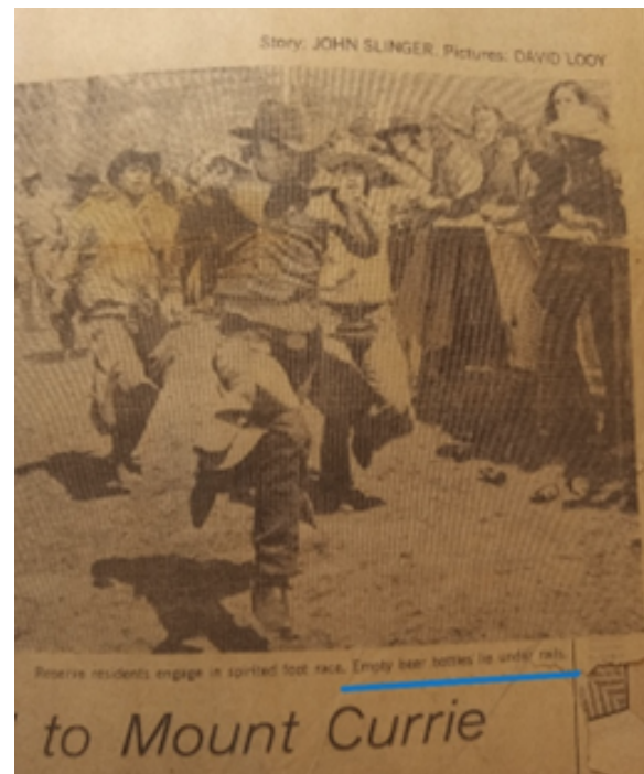
Globe and Mail, Toronto, Thursday, May 1973. Caption says "Reserve residents engage in spirited foot race. Empty beer bottles lie under rails."

Since starting this project, I have continued to focus on developing my own Indigenous mindset. As such, I have also experienced a reaction to some items in the collection. Part of developing an Indigenous mindset is recognizing (and calling out) unacceptable attitudes towards Indigenous people, even if it was published 50 years ago. I came across a newspaper article which made me cringe. I put the blue line under the caption I deem unacceptable.